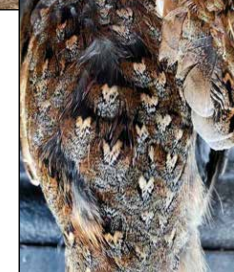
" not your normal chapter " page 5