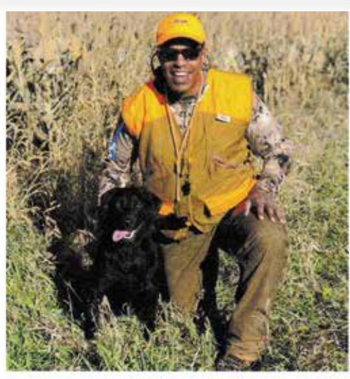
The author trained his retriever, Sunka O' War, in Chicago's green spaces before hunting waterfowl and upland birds across the nation's heartland.

After she was gone, I found myself looking for a familiar fire in the eyes of each dog I came upon, but it wasn't there. A void had been created without a solution to heal the Labrador-shaped