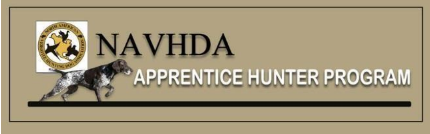
Yankee Chapter of NAVHDA